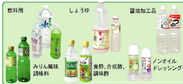
PET bottle mark

OPET Bottle {Polyethylene Terephthalate} PET bottles include plastic drink bottles, soy sauce seasoning bottles and non-dressing oil bottles.